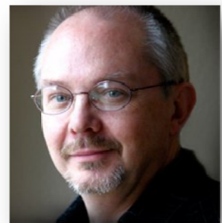
William Paul Young

According to interviews with the author, The Shack started life as a story written for Young's six grown-up children in response to his wife's request for him to explain his "out of the box" way of thinking about God. Like the book's central character, Young's own story is one of personal pain, and he describes the shack as a metaphor for the place inside ourselves where we hide our shame and pain beneath a veneer of performance. Young believes that everyone needs to deal with the contents of their shack in order to discover a new way of relating to God, living in the freedom of His grace rather than under the obligation of legalistic religion. The Shack is intended to introduce others to the confidence in God that Young claims to enjoy.